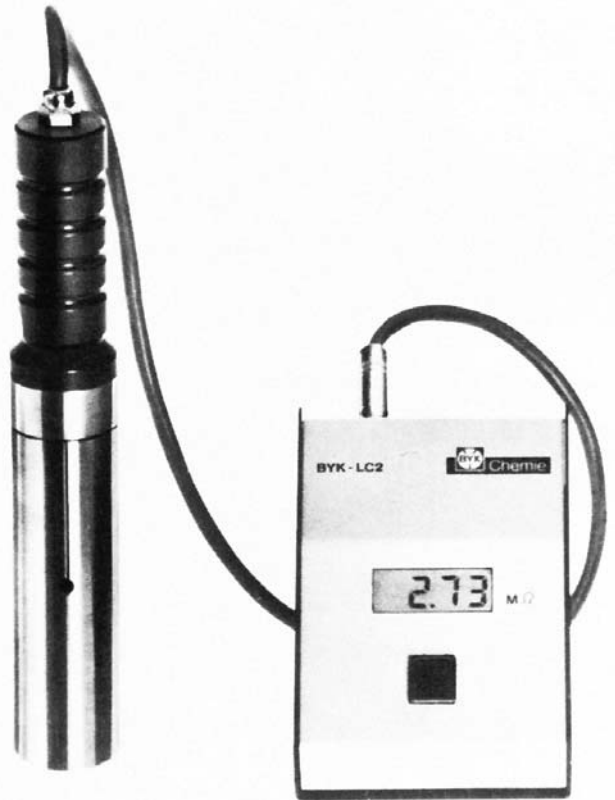
FIG. 3 Conductivity Meter

7.1 Paint Application Test Assembly —designed to provide measurement of the electrical resistance of paint formulations for all electrostatic applications. To provide greater accuracy in measuring low resistance paints, the meter is equipped with dual range selection. Range “A” is .005 to 1 MΩ, Range “B” is .05 to 20 MΩ. The original version of this device was an analog instrument with a pointer and scale as shown in Fig. 1 and many such instruments are in use. It has been replaced by a digital version, a diagram of which is in Fig. 2.